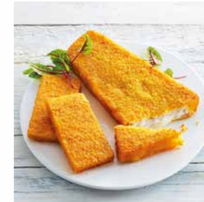
Alaska Pollock trapezoids in a crispy breading