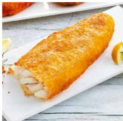
Alaska Pollock portion fillet in batter

Breadings offer an easy and tasteful opportunity to serve guest more variety and enjoyment. Our portfolio includes many different breadings: classic breading, batter, breading à la Meunière, cornflakes breading, potato breading and pretzel breading.