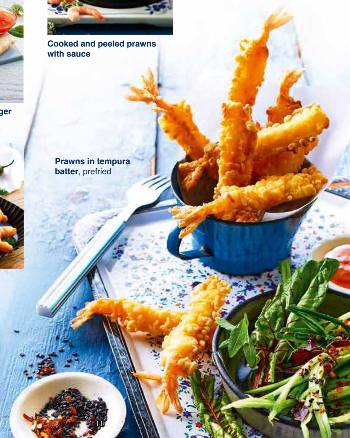
Prawns in tempura batter, prefried