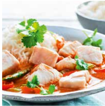
Alaska Pollock fish cubes

The preparation of light and creative fish dishes often requires the use of fish pieces, which can be easily portioned. Our natural fish cubes cut from high-value fillet blocks are an ideal basis for individual recipes. Classic fish ragouts, spicy fish gulash and exotic fish curry are just a few of many possible recipes, which can be prepared with these cubes in an easy and convenient way.