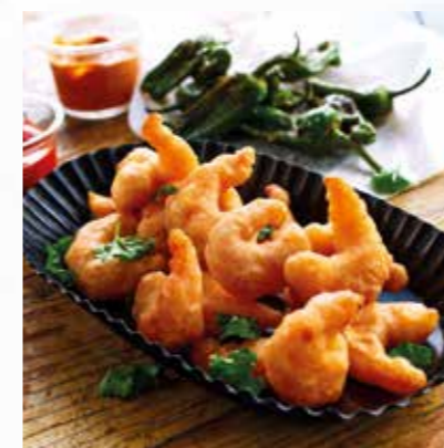
Prawns in batter, prefried