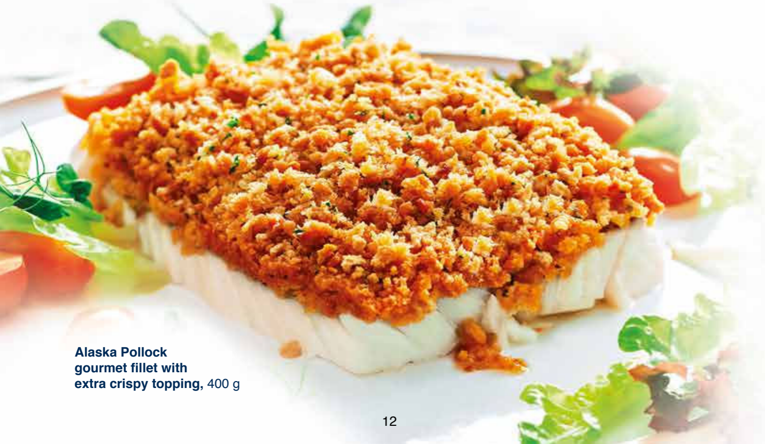
Alaska Pollock gourmet fillet with extra crispy topping, 400 g

Our gourmet fillets are cut from fish fillet blocks and refined with delicious toppings. The classic assortment of recipes like Bordelaise, Broccoli and Italiano is completed with other innovative toppings.