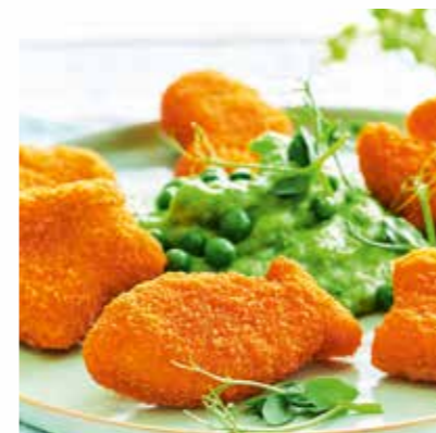
Alaska Pollock sea shapes, breaded

You eat with your eyes: The fish shapes are a real eye-catcher! Like the fish nuggets they are also made of finely minced fish meat, so the fish shapes are boneless hits for kids.