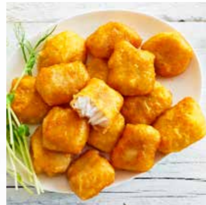
Alaska Pollock fillet bites in batter, prefried

Modern fish enjoyment: Delicious Alaska Pollock fillet pieces in a fine and crispy batter. The perfect snack which is also available as a meal solution combined with fries.