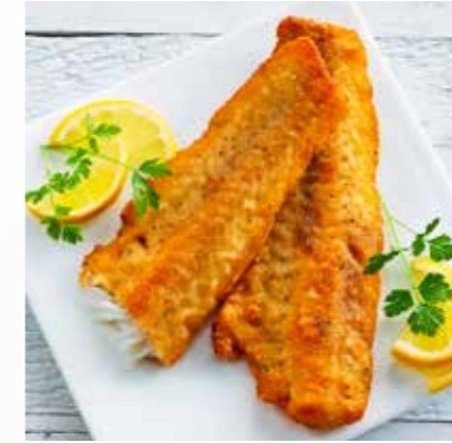
Alaska Pollock fillet classic Meunière, prefried

Natural fish fillets with a crispy thin coating: Classic Meunière, Rosemary & Crushed Black Pepper, Tomato & Oregano, Sea Salt & Crushed Black Pepper, Lemon & Crushed Black Pepper, Seed Breading.