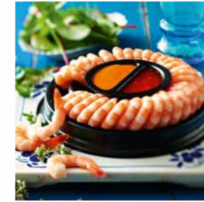
Cooked and peeled prawns with sauce