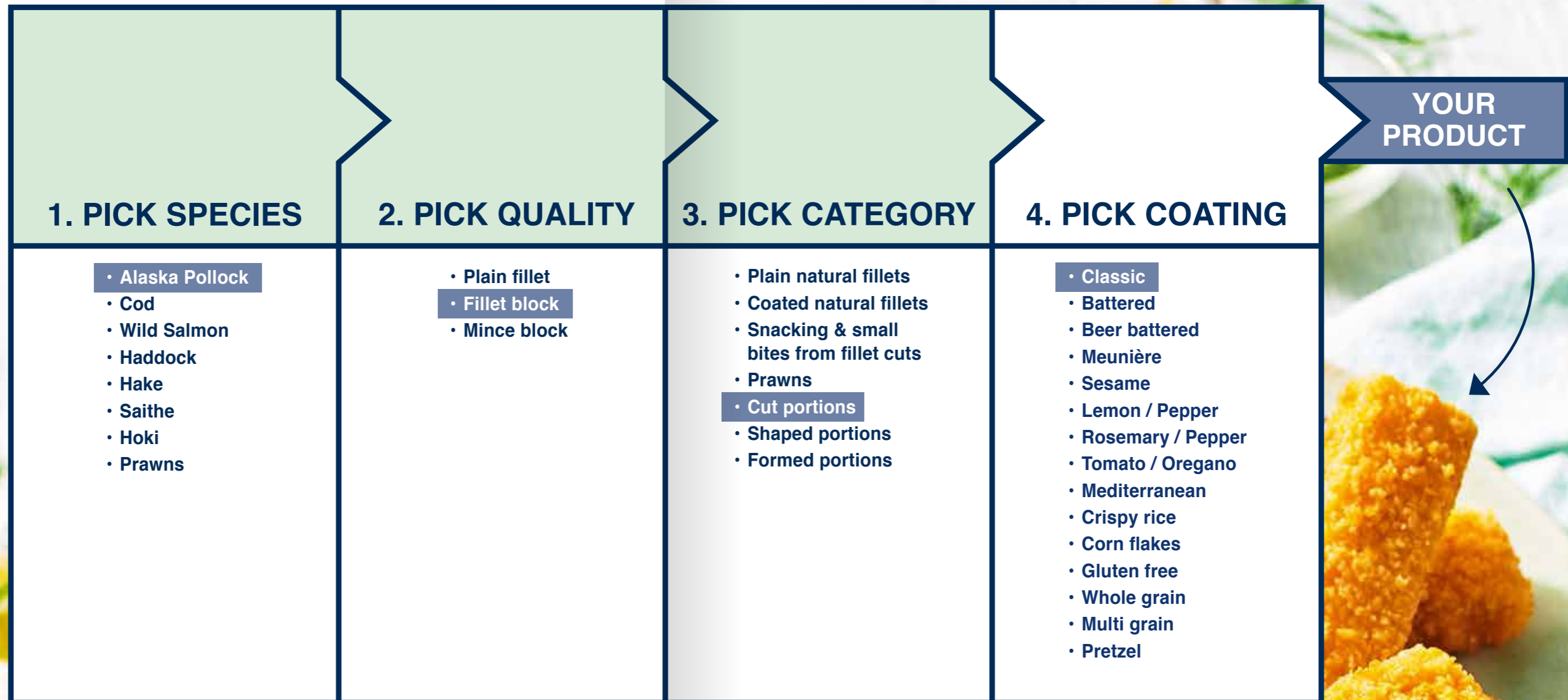
Alaska Pollock fish fingers breaded, 30g, prefried

Our modular system enables individual requests