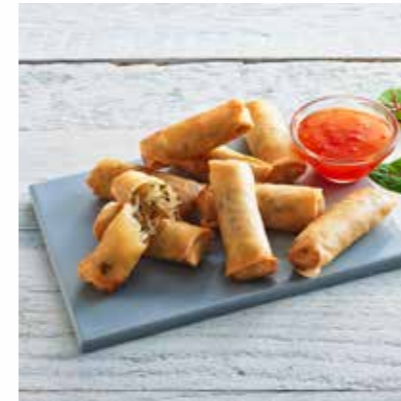
Spring rolls with White Tiger prawns, prefried

Classic Asian appetisers like crispy tempura battered prawns and richly filled spring rolls come along with trendy US style popcorn prawns or coconut crumbed finger food sticks.