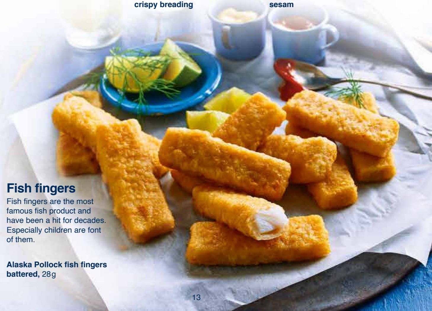
Alaska Pollock fish fingers battered, 28g

Fish fingers are the most famous fish product and have been a hit for decades. Especially children are fond of them.