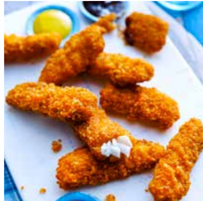
Alaska Pollock fillet stripes, coated in mediterranean breading, prefried

The fillet stripes are the latest snack hit created by our product development team. They score with their natural shape, as they consist of individually cut stripes of Alaska Pollock fillets in different coatings.