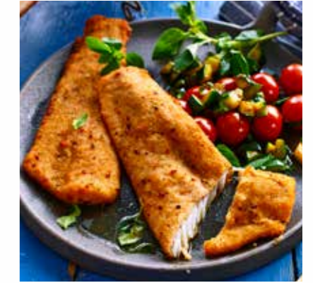
Alaska Pollock fillet Tomato & Oregano, prefried