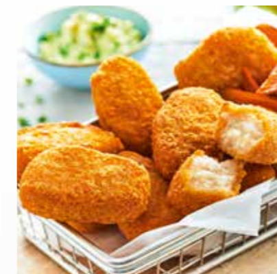
Alaska Pollock minced nuggets, breaded

They can be served in many different ways: From a Nordic dish with dill cream & cucumber salad to an exotic dish with chili dip & wok vegetables.