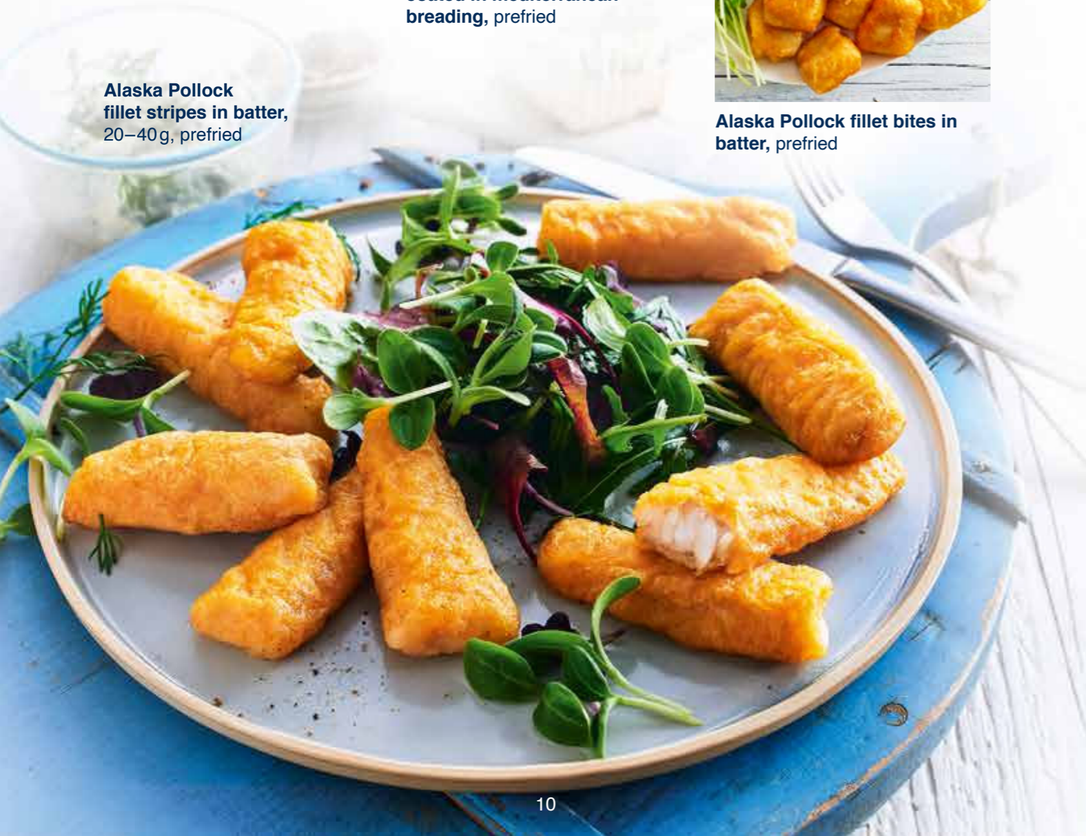
Alaska Pollock fillet stripes in batter, 20–40g, prefried