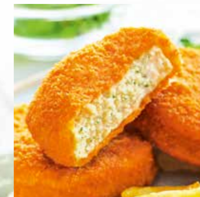
Fish cakes, breaded

This is a well-known and popular classic among fish snacks. Juicy finely minced fish meat – mixed with a tasty seasoning and coated by a crispy breading.