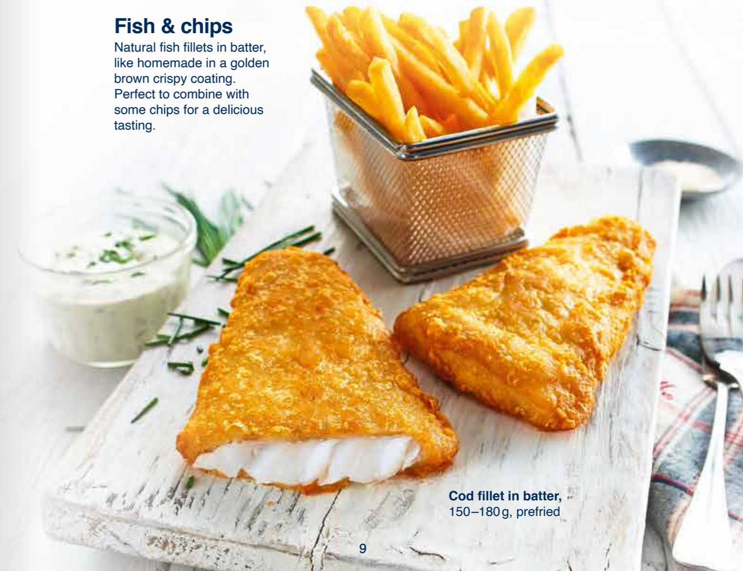
Cod fillet in batter, 150–180g, prefried

Natural fish fillets in batter, like homemade in a golden brown crispy coating. Perfect to combine with some chips for a delicious tasting.