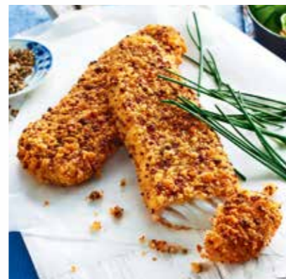
Alaska Pollock portion fillet with a pretzel breading