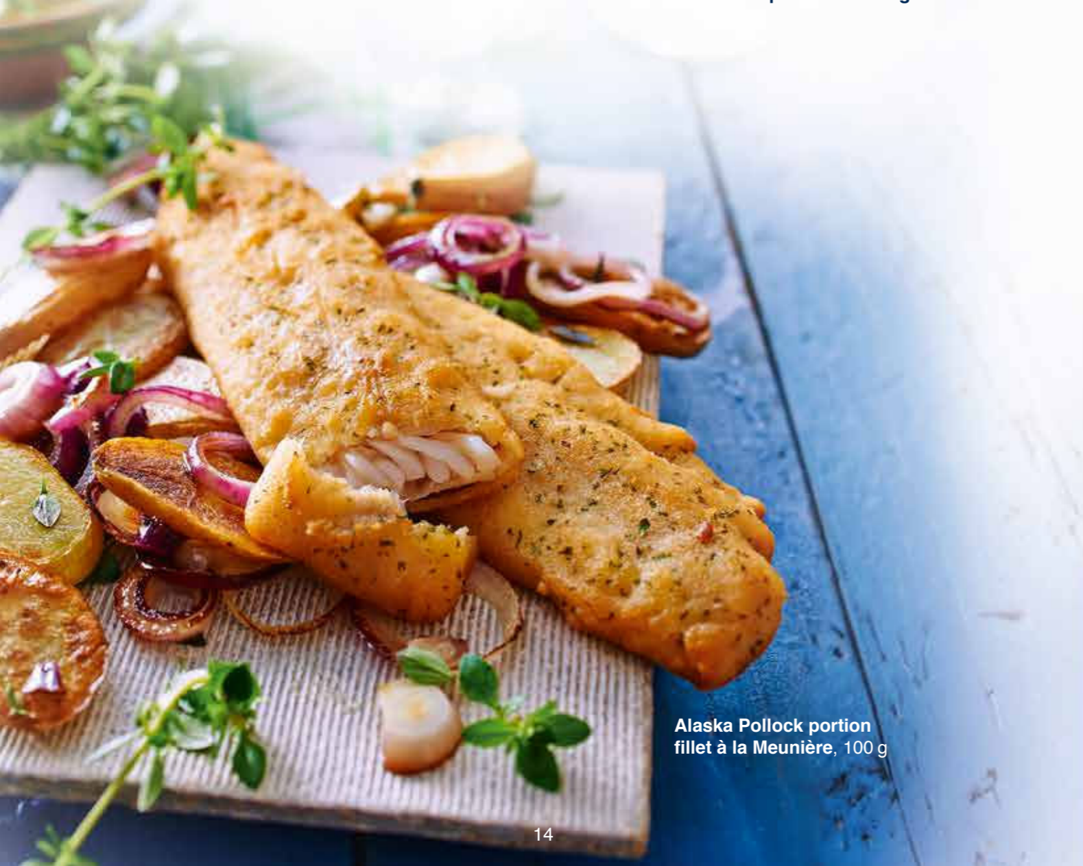
Alaska Pollock portion fillet à la Meunière, 100 g