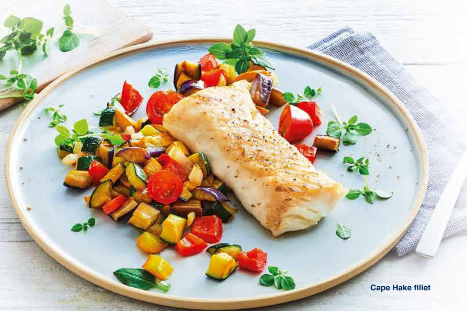
Cape Hake fillet

Our portfolio includes many different species like Alaska Pollock, Cod, Hake, Haddock, Catfish, Wild Salmon, Salmon and Pangasius.