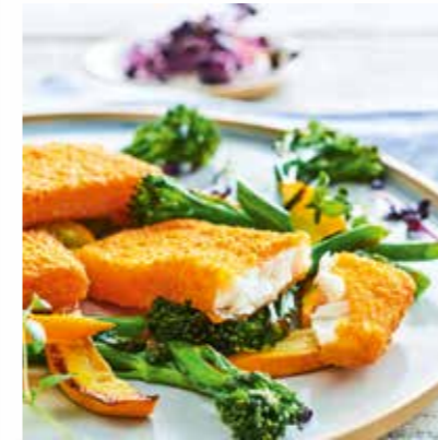
Cod portions, breaded

The crispy breaded portions and our popular trapezoid shape can be bought in different sizes as a breaded or a battered version. They are contemporary convenience products for tasty uncomplicated dishes like fish sandwiches and fish baguettes.