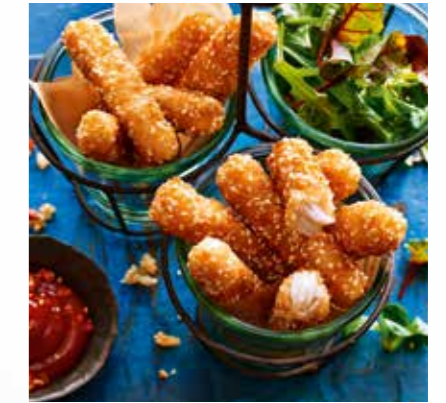
Alaska Pollock Stick & dip sesame